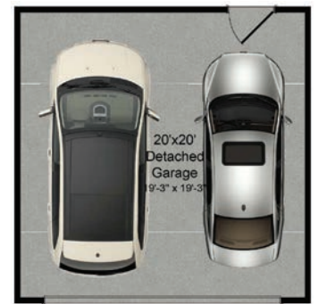
20 x 20 GARAGE (Optional)

Visit GambriellView.com for pricing and community information.